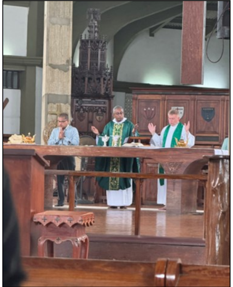
Photo: ABM pilgrims attended a Sunday service at the Cathedral of Christ the Living Saviour, Colombo, Sri Lanka.

We make our prayer through the same Jesus Christ our Lord. Amen.