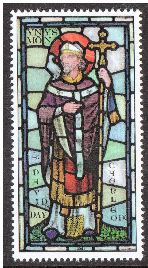
St David – a postage stamp from the United Kingdom

The Anglican Board of Mission, Locked Bag Q4005, Queen Victoria Building, New South Wales 1230.