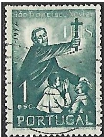
Postage stamp from Portugal featuring the 'Apostle of the Far East', the Jesuit Francis Xavier. His feast day is on 3 December.

Your used and mint postage stamps are valuable to ABM because we can use them to help fund mission.