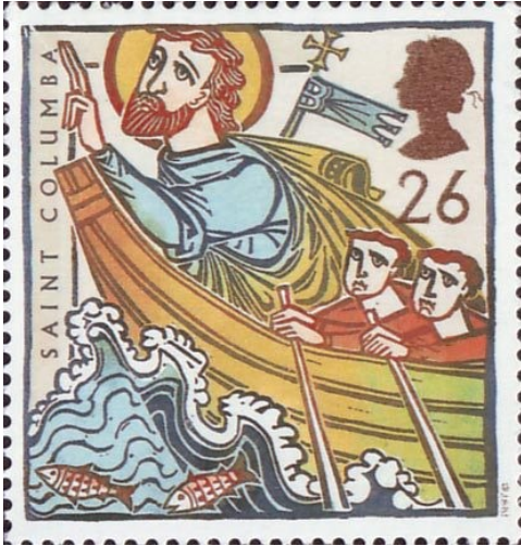
A postage stamp from Britain featuring St Columba of Iona, whose feast day is on 9 June