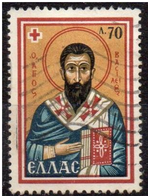
A Greek postage stamp featuring St Basil the Great , whose Feast Day is on Monday 2 January. For more information, see en.wikipedia.org/wiki/Basil_of_Caesarea