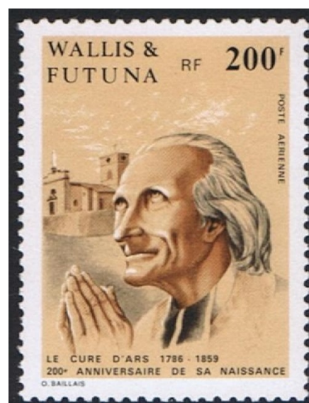
A postage stamp from Wallis and Futuna (a French Overseas Collectivity) featuring the Curé d'Ars, Jean-Baptiste Vianney. His Feast Day is 4 August.

ABM, Locked Bag Q4005, Queen Victoria Building, New South Wales 1230.