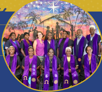
Certificate IV in Christian Ministry and Theology graduates

Wontulp-Bi-Buya College in North Queensland supports the development of Aboriginal and Torres Strait Islander church and community leaders through study programs leading to awards in theology, suicide prevention, addictions management and community development. The College has an ethos of providing culturally grounded training, led by Aboriginal and Torres Strait Islander people, and delivered in an appropriate way for a diverse student cohort. More than a training provider, Wontulp is a transforming community that empowers people with the faith, vision and skills, and to be effective in building up their people, their church and their community.