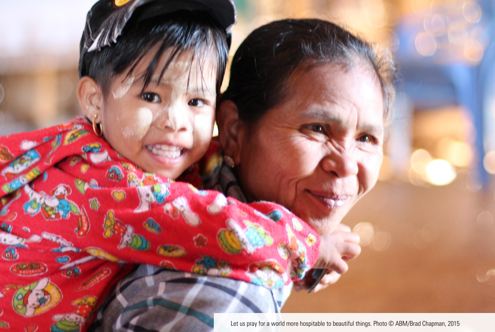
Let us pray for a world more hospitable to beautiful things.

“We were made to enjoy music, to enjoy beautiful sunsets, to enjoy looking at the billows of the sea and to be thrilled with a rose that is bedecked with dew... Human beings are actually created for the transcendent, for the sublime, for the beautiful, for the truthful... and all of us are given the task of trying to make this world a little more hospitable to these beautiful things.”