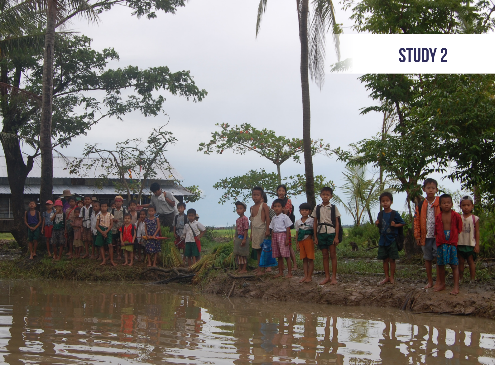
As we hear the story of the effects of Cyclone Nargis, let us take urgent action on climate change so that the poor and vulnerable are protected.