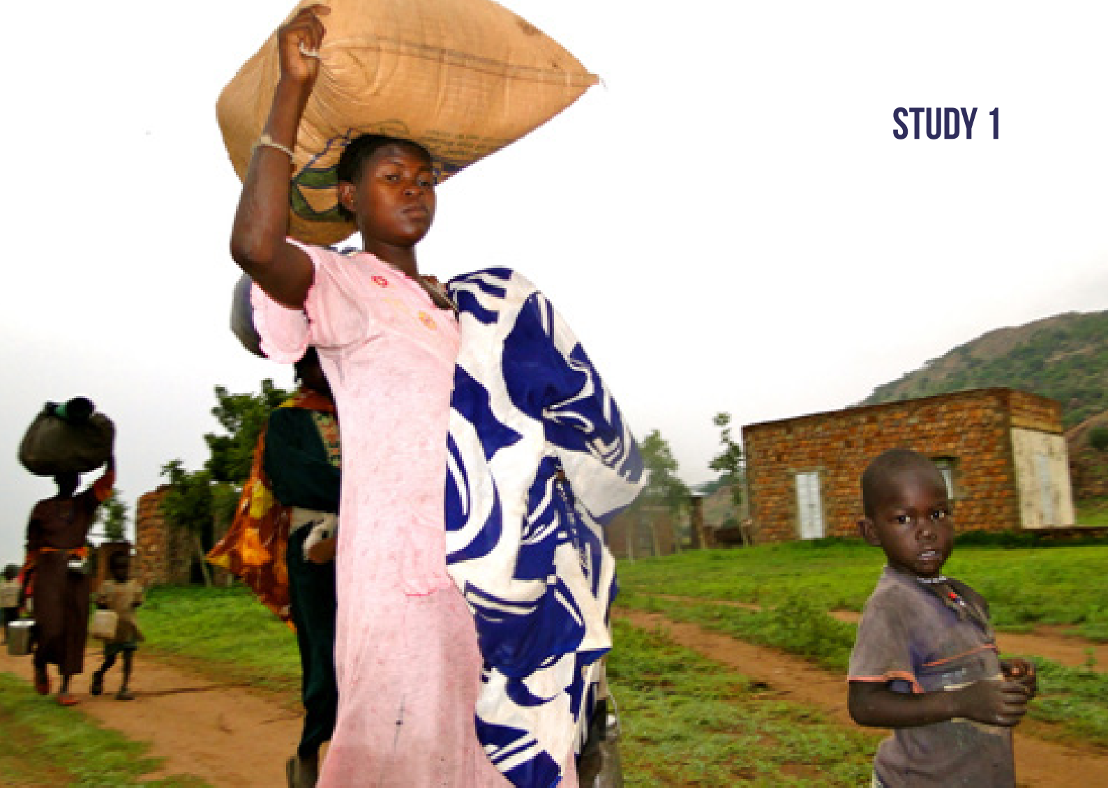
We pray for an end to poverty in all its forms, everywhere. Photo © Episcopal Church of Sudan, 2011. Used with permission.